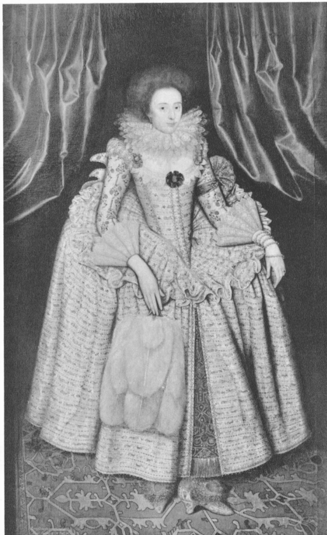
338 Anne Clifford, Countess of Dorset c 1610 Oil on canvas 83¼ x 51¼ in / 211.5 x 130.2 cm

See J. Malay ed., Anne Clifford's Autobiographical Writing, 1590-1676 (Manchester, 2018), 72.