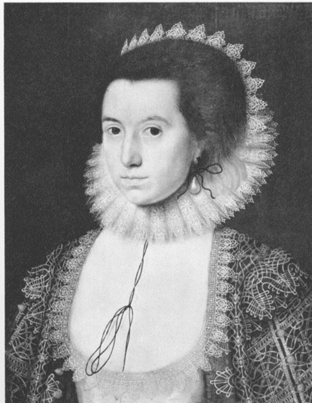
352 Anne Clifford, Countess of Dorset, later Countess of Pembroke c 1615-20 Oil on panel 23 x 17½ in / 58.5 x 44.5 cm